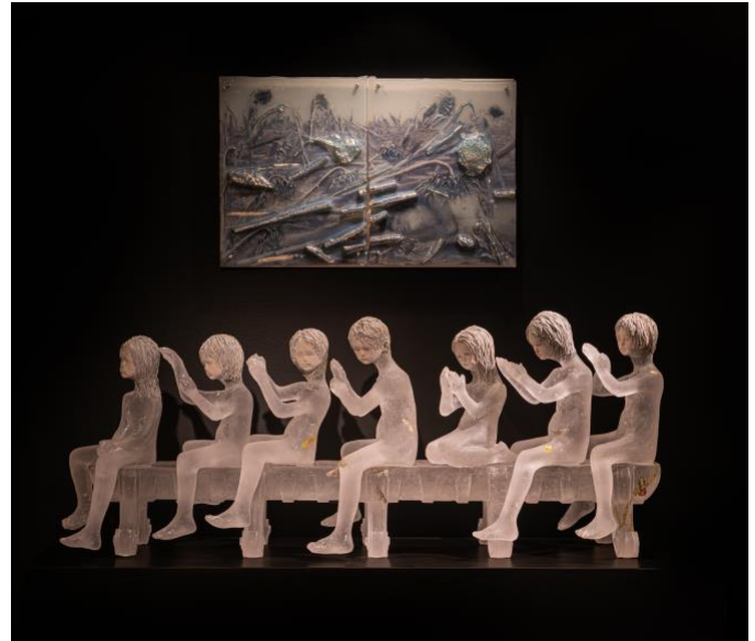
On exhibit at the Imagine Museum