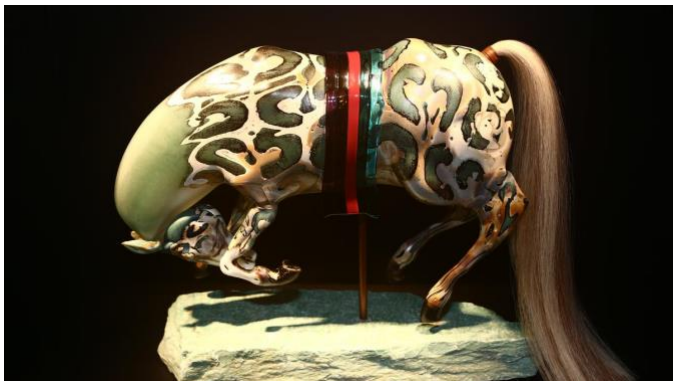
Imagine Museum, St. Petersburg Florida