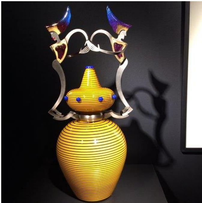
Imagine Museum, St. Petersburg Florida