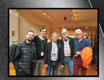
Habatat is looking forward to seeing everyone in 2019!